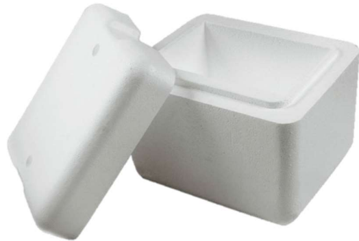
Figure 1 EPS biodegradable coolers look just like standard coolers. They are available in over 20 sizes of both standard and high density versions.

Although EPS is a fantastic packaging solution, today's challenge is the growing waste created by increased temperature-sensitive biologic-based pharmaceuticals and meal kit distribution during the Covid-19 pandemic. The reason being that EPS is 98% air, making it a low-density solution that is economically unviable to store and transport for recycling. Therefore, most of it ends up in landfills, negatively affecting the environment due to its non-biodegradability. This problem has resulted in an increase in research attention towards biodegradable alternatives.